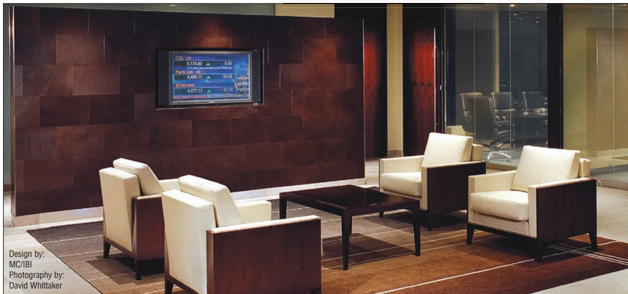
Design by: MC/IBI

Stocked in 7 colors in large sheets of approximately 10-12 sq. ft., these may be die-cut to any size or shape or left in large sections for installation in table or desk tops. The leather is flexible and can be wrapped around desk edges, stairs or columns. Custom colors are available with a minimum order of 500 sq. ft.